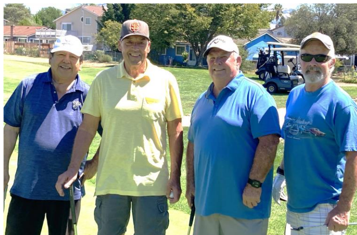
A Picture From The Past:

CTP Hole # 6 Group#1 - Cleland 31' 3" Group#2 = No one Hole # 15 Group#1 - Nistler 6' 6" Group#2 Allen 10' 2"