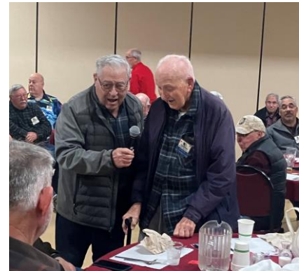
Birthday Boys Sing